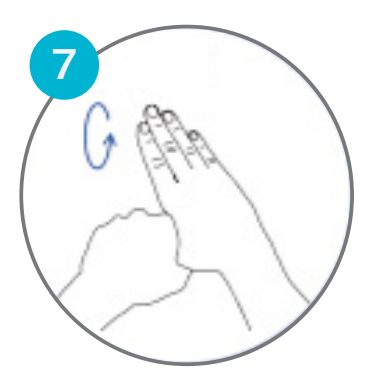
Rotational rubbing of thumbs clasped in opposite palm