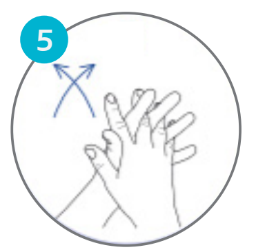
Palm to palm with fingers interlaced